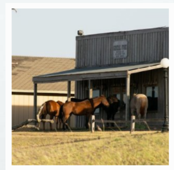
Homes on the Range: The Northern Tier's Missing Households