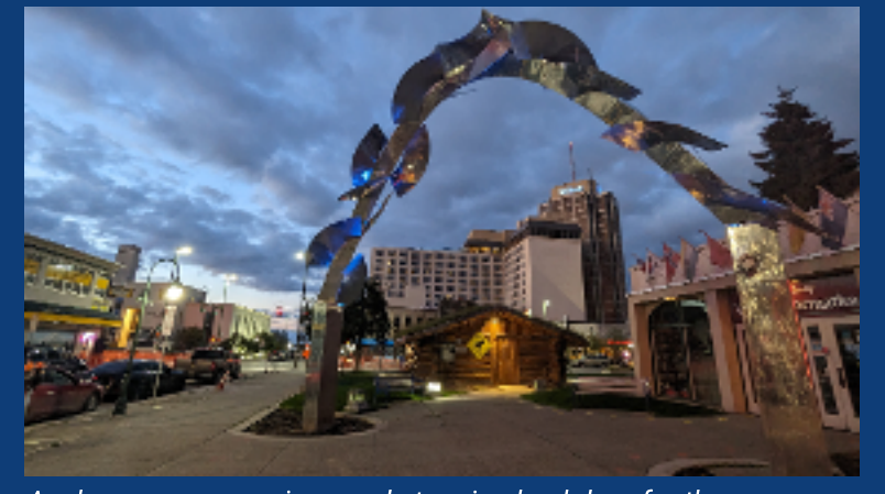
Anchorage was a unique and stunning backdrop for the conference, with mobile tours and time to explore.