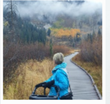
The Notable Benefits of Planning and Maintaining Trail Systems (and where to be Cautious)