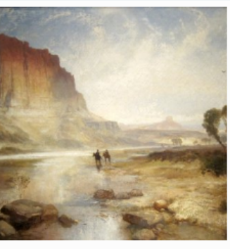
Wilderness and Wildness – An Environmental Planner's Perspective