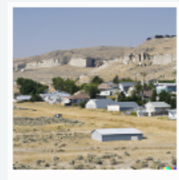
ChatGPT and Western Planning: Discussing Planning with an Al